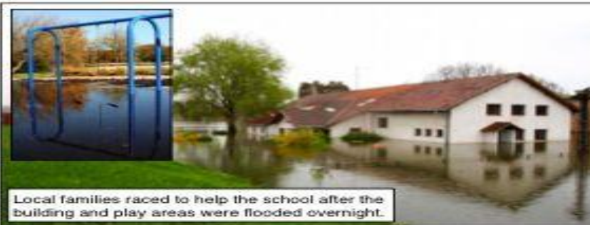
Local families raced to help the school after the building and play areas were flooded overnight.

At the height of the flood, the water was almost 20 centimetres deep in some places.